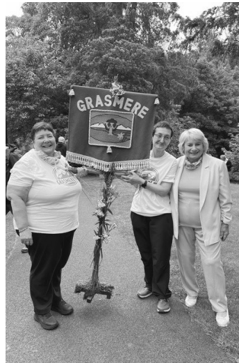
The GWI banner Rushbearing