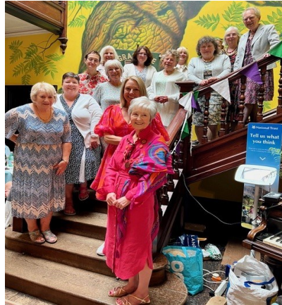
GWI committee members celebrating our 105th birthday at the Allan Bank in June.